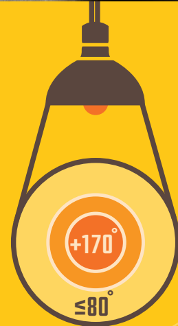
UNEVEN HEAT CAUSES DISCOMFORT AND STRESS